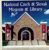
National Czech & Slovak Museum & Library

The National Czech & Slovak Museum & Library is host to Homelands: The Story of the Czech and Slovak People , the permanent exhibit featuring folk costumes, glassware, unique works of art and various artifacts. The research library houses a large collection of books, music, periodicals and other materials in Czech, Slovak and English. The museum also sponsors various programs throughout the year. Czech glass, ceramics, jewelry, books and beautiful decorated eggs may be purchased in the museum's store.