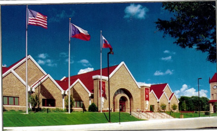
The National Czech & Slovak Museum & Library features an exquisite collection of handcrafted Czech and Slovak costumes, glassware, folk art, military artifacts, a restored 19th century immigration home and much more.