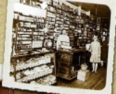
Area General Store circa 1922

Find out why Fredericksburg is a shopper's dream. And prepare to be enchanted as you rediscover that spirited child within yourself! Here, you'll find treasures from 18th century toys and hand-made crafts to antique furniture and daleipiers. Be sure to try one of our day spas. It's a perfectly relaxing way to end the day.