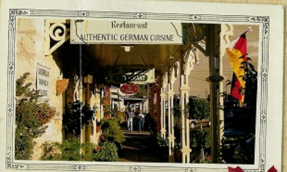
Main Street 1940

Stollen - German Christmas cakes - were brought here by ship. Then traveled by ox cart to the Hill Country. With soft flowers and celebrations are enjoyed by all. Stollen - German Christmas cakes - were brought here by ship. Then traveled by ox cart to the Hill Country. With soft flowers and celebrations are enjoyed by all.