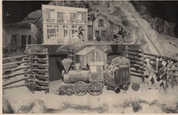
Scene From HISTORAMA Wyatt Earp kills Frank Stilwell, assassin of Morgan Earp, in the Tucson train station