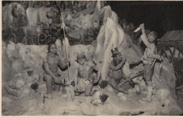
Scene From HISTORAMA Early Apache Inhabitants